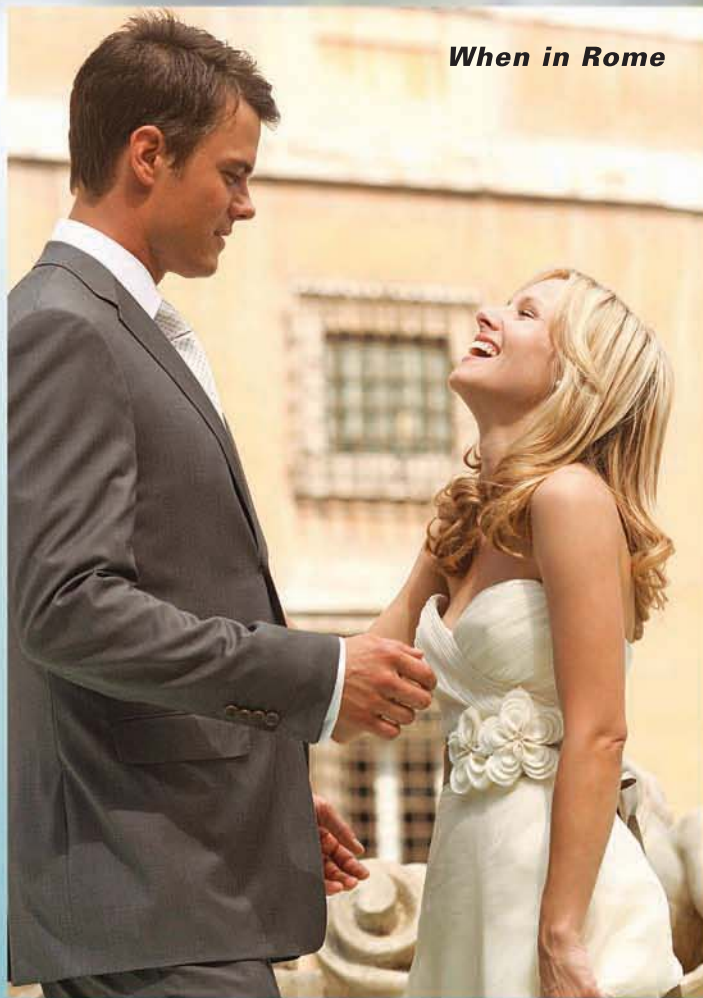
When in Rome

A love story revolving around five relationships in Los Angeles, all of which are put through the paces during the course of one February 14.